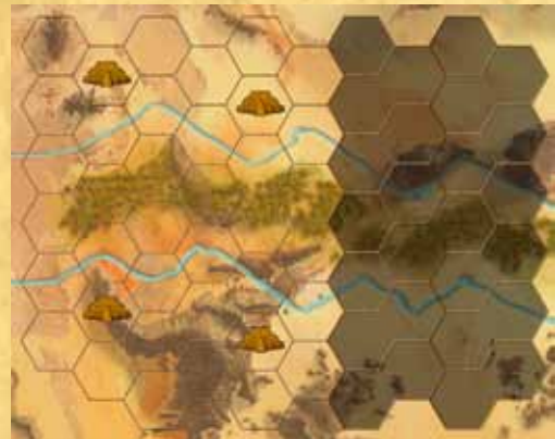
Assyria with 2 players