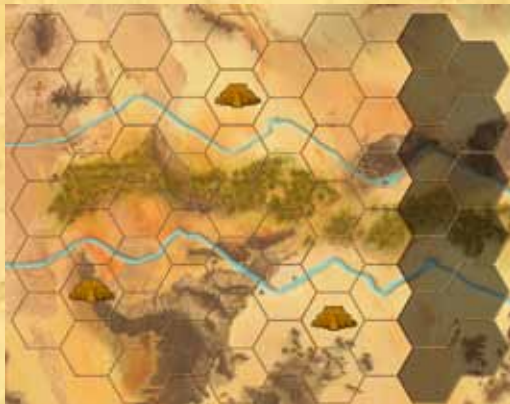
Assyria with 3 players