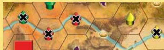
Flooding: Huts located along the river are removed from the board.