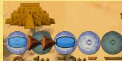
Offering: Blue spends 2 camels and advances their marker by two spaces along the offerings track.