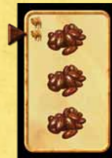
Buying cards: Green spends 2 camels and buys the 3 Dates card.