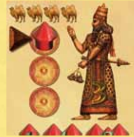
Intrigue: Red spends 4 camels and places a hut on the first available space of the higher dignitary.

Note: A player who hasn't placed a single hut on any dignitary is not ranked and can't score points.