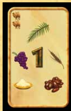
Food (Wild card)